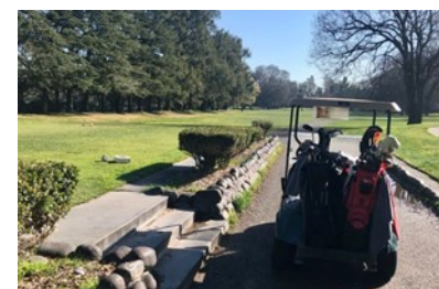
Bing Maloney Golf Course